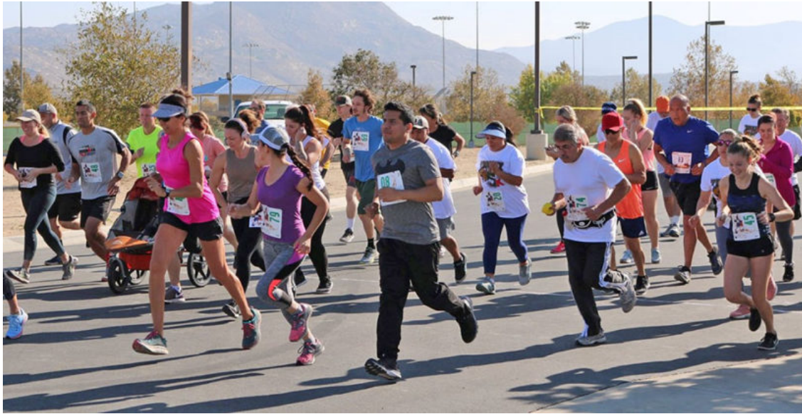
Participants compete during the 2018 Turkey Trot 5K Family Fun Run. The 2019 event will take off running Saturday, Nov. 23, at Diamond Valley Lake Community Park in Hemet.

HEMET – Registration is underway for the annual Turkey Trot 5K Family Fun Run which will take place Saturday, Nov. 23, at Valley-Wide Recreation and Park District’s Diamond Valley Lake Community Park in Hemet.