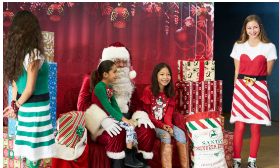
Visits with St. Nick is among the activities during Breakfast with Santa Saturday, Dec. 14, at the Sport Center at Regional Park in San Jacinto.