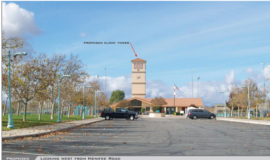
The position of a proposed cell phone tower in Wheatfield Park is shown in this graphic.

http://www.menifee247.com/2019/12/city-council-denies-proposal-for-cell-tower-in-wheatfield.html