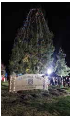
The official Christmas Tree lighting in San Jacinto took place last Friday at Valley-Wide Regional Park in San Jacinto.

Festivities began Friday, Nov. 30 with a Christmas Tree Lighting at Regional Park in