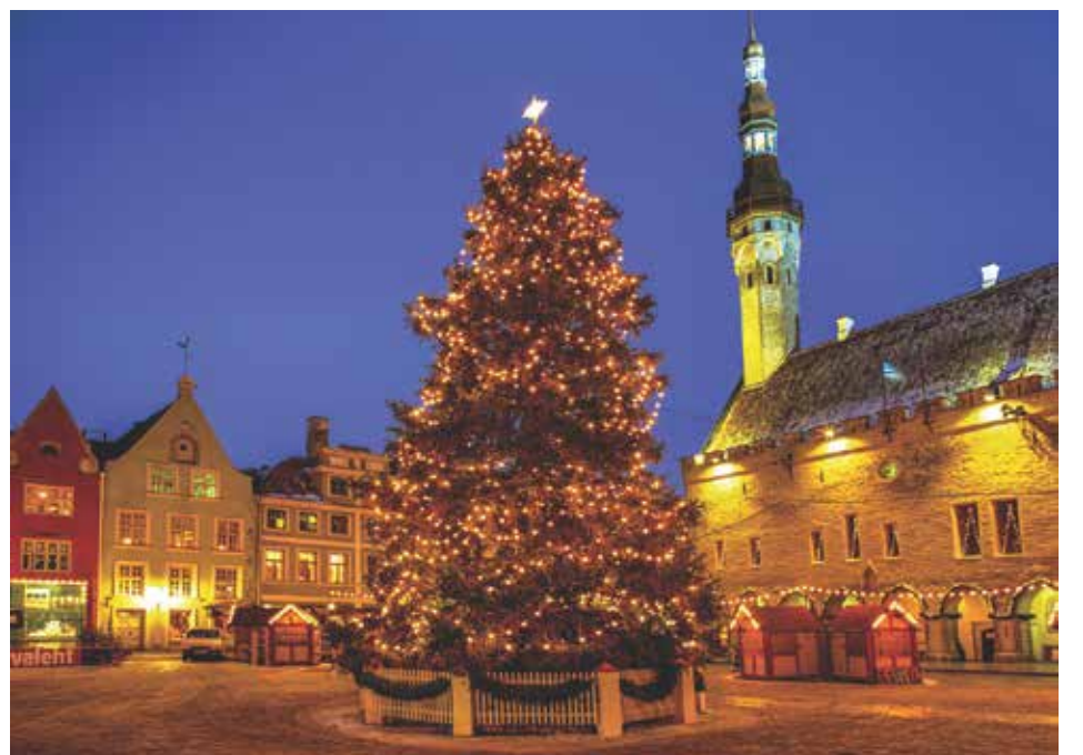
The official Christmas Tree lighting in San Jacinto took place last Friday at Valley-Wide Regional Park in San Jacinto.