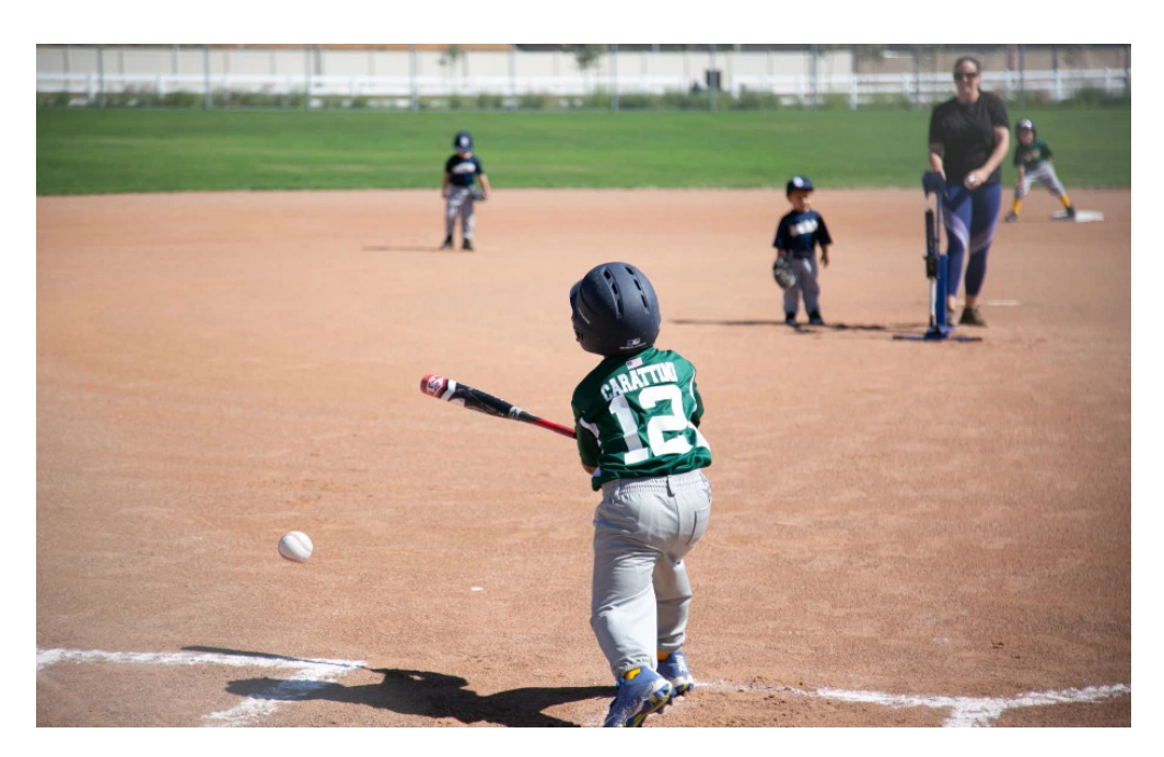
Signups are underway for youth baseball and softball programs operated by Valley-Wide Recreation and Park District.

By STAFF REPORT | The Press-Enterprise PUBLISHED: January 17, 2019 at 2:36 pm | UPDATED: January 17, 2019 at 2:36 pm